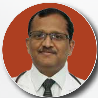
Dr. P. Nageshwar Reddy Telangana